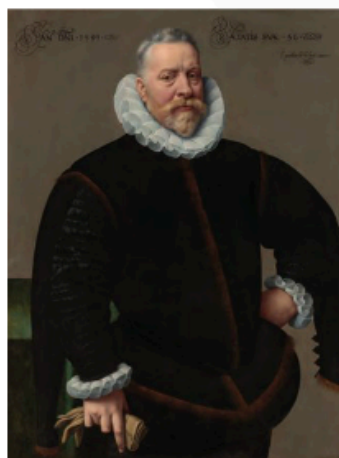
An unknown man , by Frans Pourbus the Younger (1569-1622). Oil on panel, 119 by 96.5 cm. THE WEISS GALLERY, LONDON