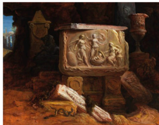
Sarcophagus with a bas-relief showing the discovery of Erichonius by the daughters of Cecrops , by Henry Farquarson (1655/65-1736). Oil on canvas, 38 by 49 cm. RAFAEL VALLS LTD, LONDON