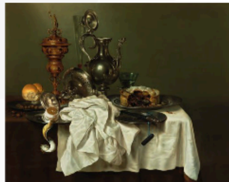
Still life , by Willem Claesz Heda (1594-1681). Oil on panel, 50.6 by 101.5 cm. FRINCH & COMPANY, NEW YORK