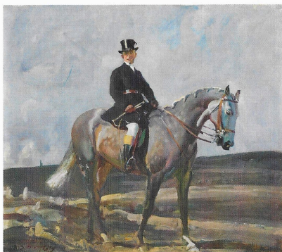
Above: Rountree Tryon's exhibition Masters of their Field: The great British sporting painters takes place at its Bury Street gallery. It includes Alfred Munnings' The Pad Groom , an oil on canvas painting measuring 21½ x 24in (54 x 61cm) and is offered for £280,000 .

See right for a sample of events as well as a selection of the works on offer in this upcoming edition.