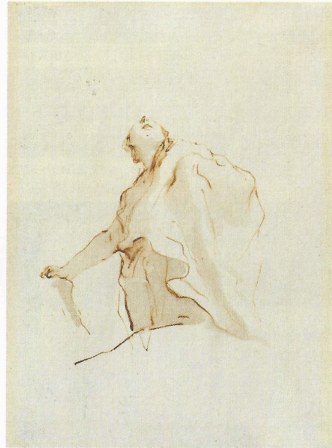
Left: Stephen Ongpin Fine Art offers this c.1750 Study for a Ceiling, A Reclining Figure on a Cloud , completed in pen and brown ink and wash. It is available for a price in the region of £35,000 .

Left: Rupert Wace times the launch of its new catalogue to coincide with London Art Week . The cover piece is this important Egyptian bronze figure of the Pharaoh Osorkon II, produced during his reign (874-850BC). Once part of the Gayer Anderson collection, acquired prior to 1914, the piece measures 4½in (11cm) high and bears a cartouche to the chest. It is available for £280,000 .