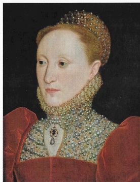
Above: The Weiss Gallery's exhibition Courting Favour: From Elizabeth I to James I runs from June 26-July 14. One of its featured paintings is this portrait of a young Queen Elizabeth I, c.1560. Measuring 18 x 13½in (45 x 34cm), it is offered for £150,000 .