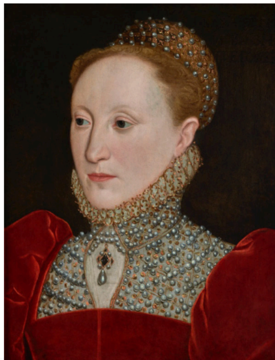
English School, circa 1560s, Elizabeth I of England (1533–1603), Oil on panel: 17 3/4 x 13 1/2 in. (45.2 x 34.4 cm.) Painted circa 1560s, £150,000.

The show's centerpiece will be a stunning portrait of a young Queen Elizabeth I , which is a bust version of the full-length, which is the painting on loan to Tate Britain . Either side of the masterpiece will be portraits of her two great favourites, Robert Dudley, 1st Earl of Leicester and Robert Devereux, 2nd Earl of Essex .