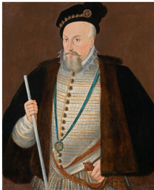
Attributed to Sir William Segar (c.1554 – 1633), Robert Dudley, 1st Earl of Leicester (1532 – 1588). Oil on panel: 35 x 29 3/4 in. (88.9 x 75.6 cm.) Painted circa 1587, £125,000.

Further works in the exhibition include portrayals of James I's Queen Consort, Anne of Denmark and a drawing of her son Henry Frederick, Prince of Wales , described by Sir Roy Strong as the 'Lost King'; as well as Sir Thomas Drake , Sir Francis Drake's brother, and Elizabeth I's Lord Keeper of the Privy Seal, Sir John Puckering .